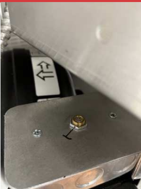
CAPTURE JET SETTING