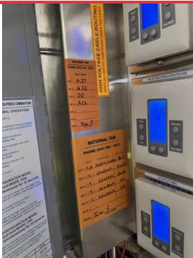
SUNCOAST PANEL STICKERS