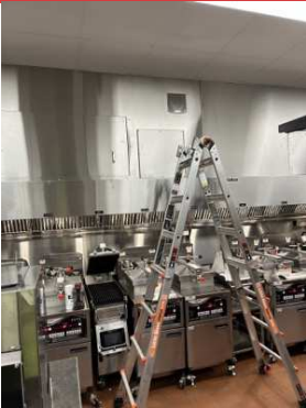
HOOD #1 L&R